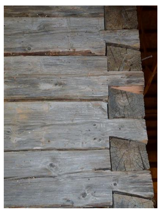
The logs were hewn and notched so expertly that no chinking between them was needed to keep out the cold.

These questions—and some historical theories—will be explored in a special presentation to members of the Molalla River Alliance at its annual meeting on Friday, May 5 at the Molalla Retreat.