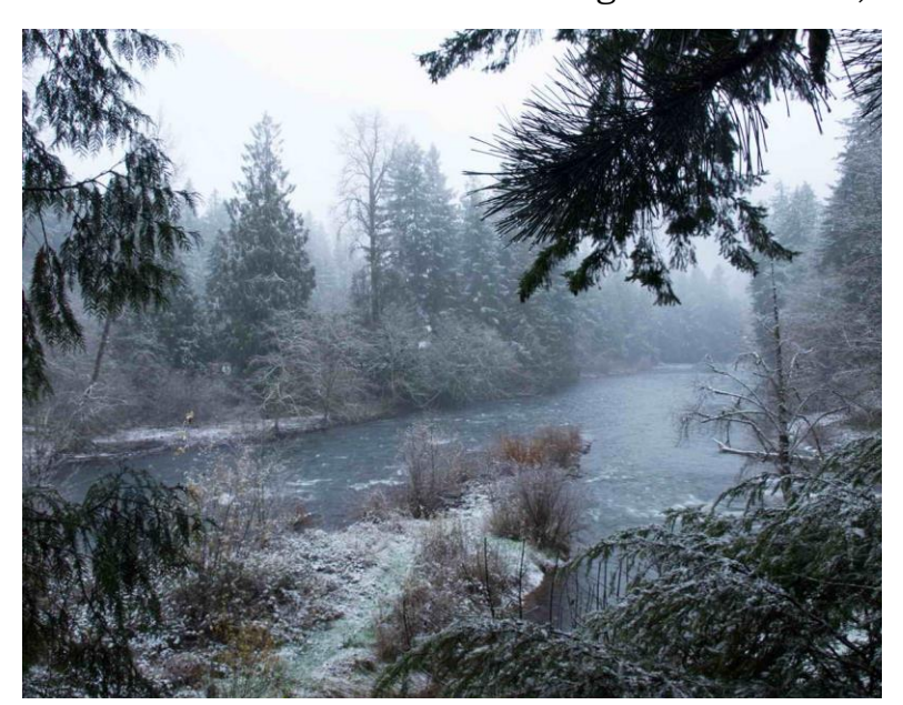
The confluence hole

the holding water. I stood at the head of the drift, already immersed in the evening, watching a kingfisher fly past on his way downriver, when the line began to slip